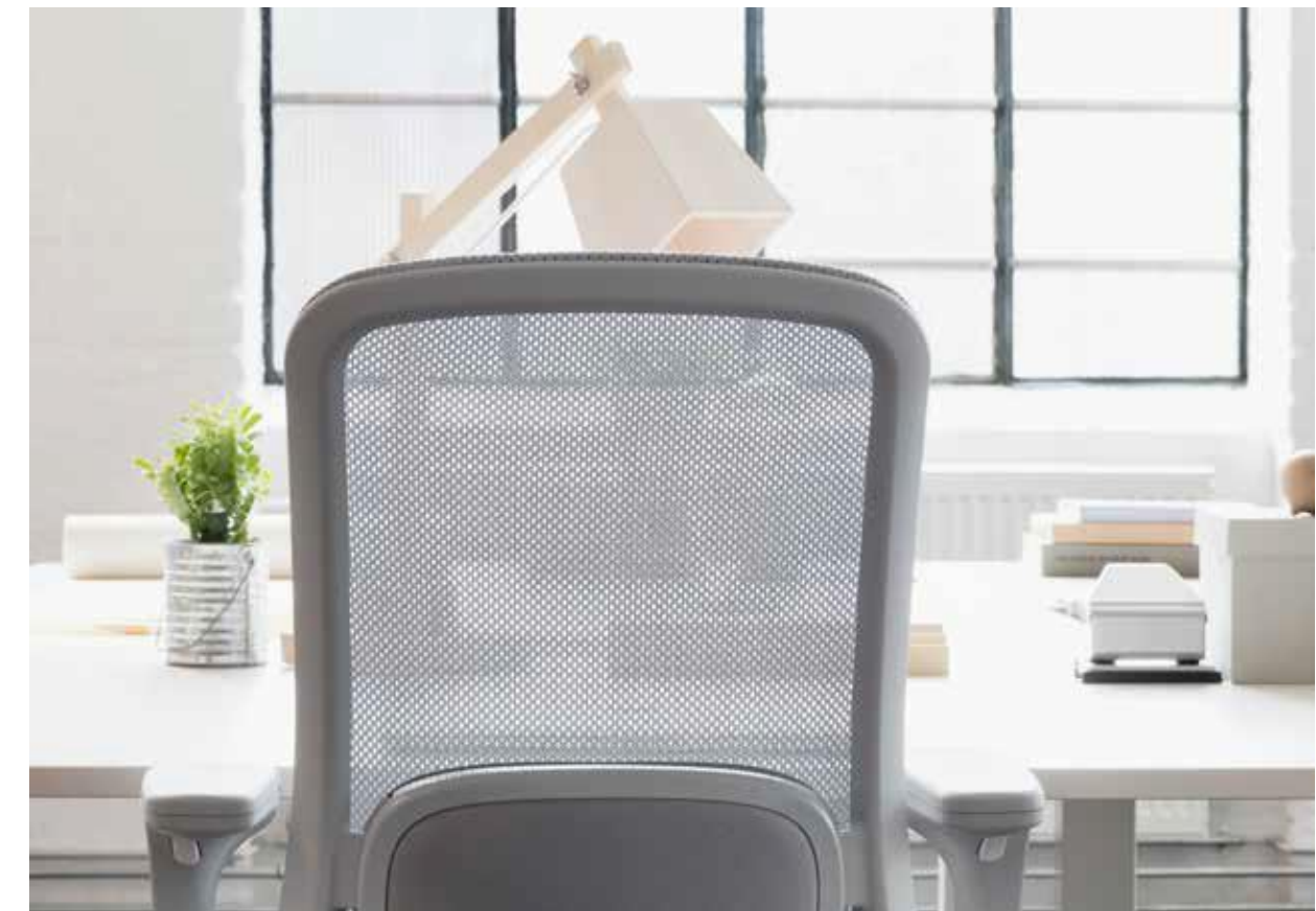
HÅG SoFi mesh 7500 with light grey mesh back (MEH002). Textile: Nexus Pewter 01 from Camira.