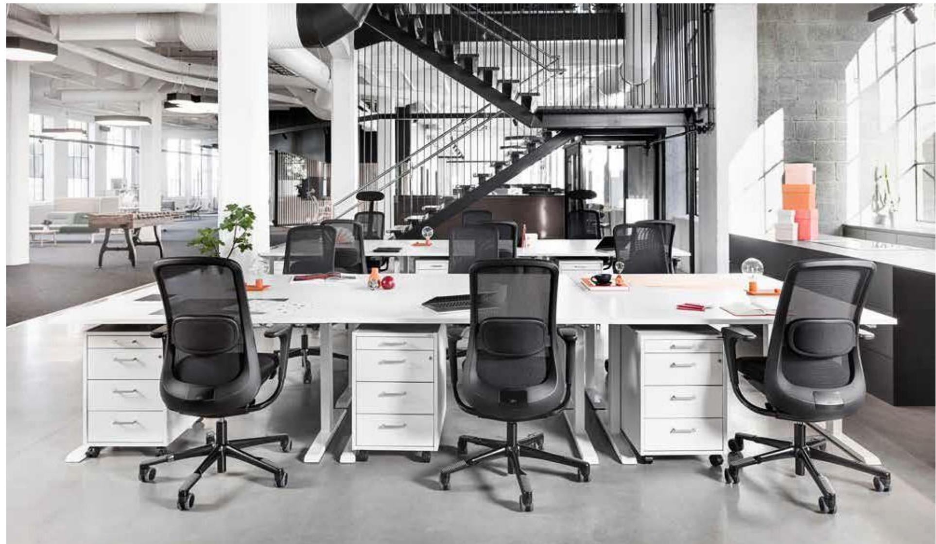
HÅG SoFi 7500 with black mesh (MEH001) back. Textile: Note 60999 from Gabriel.