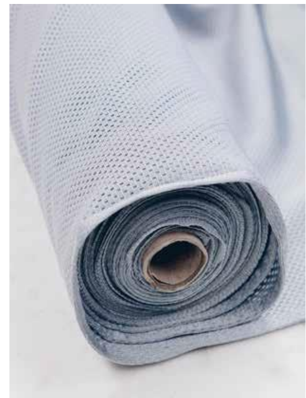
HÅG SoFi with mesh back in production at Røros factory in Norway